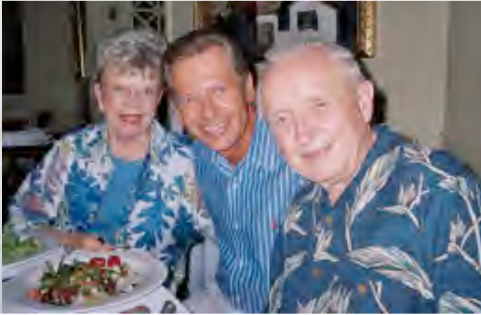
Summer 2006 KY-ACDA